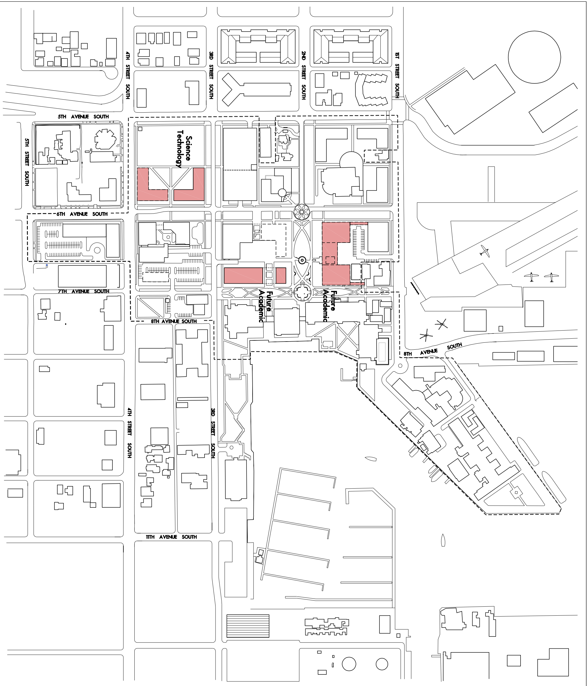
Figure 5-a Academic Facilities Plan 10 Year