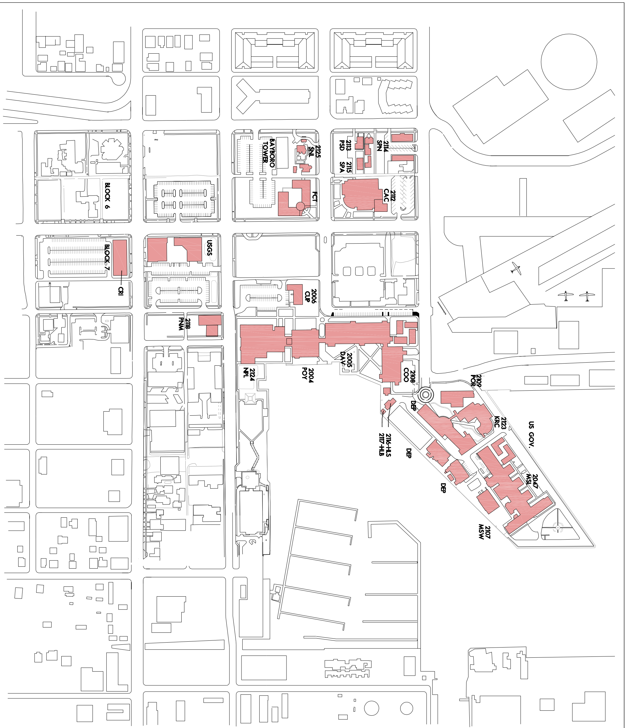
Figure 17-a Facilities Maintenance Existing